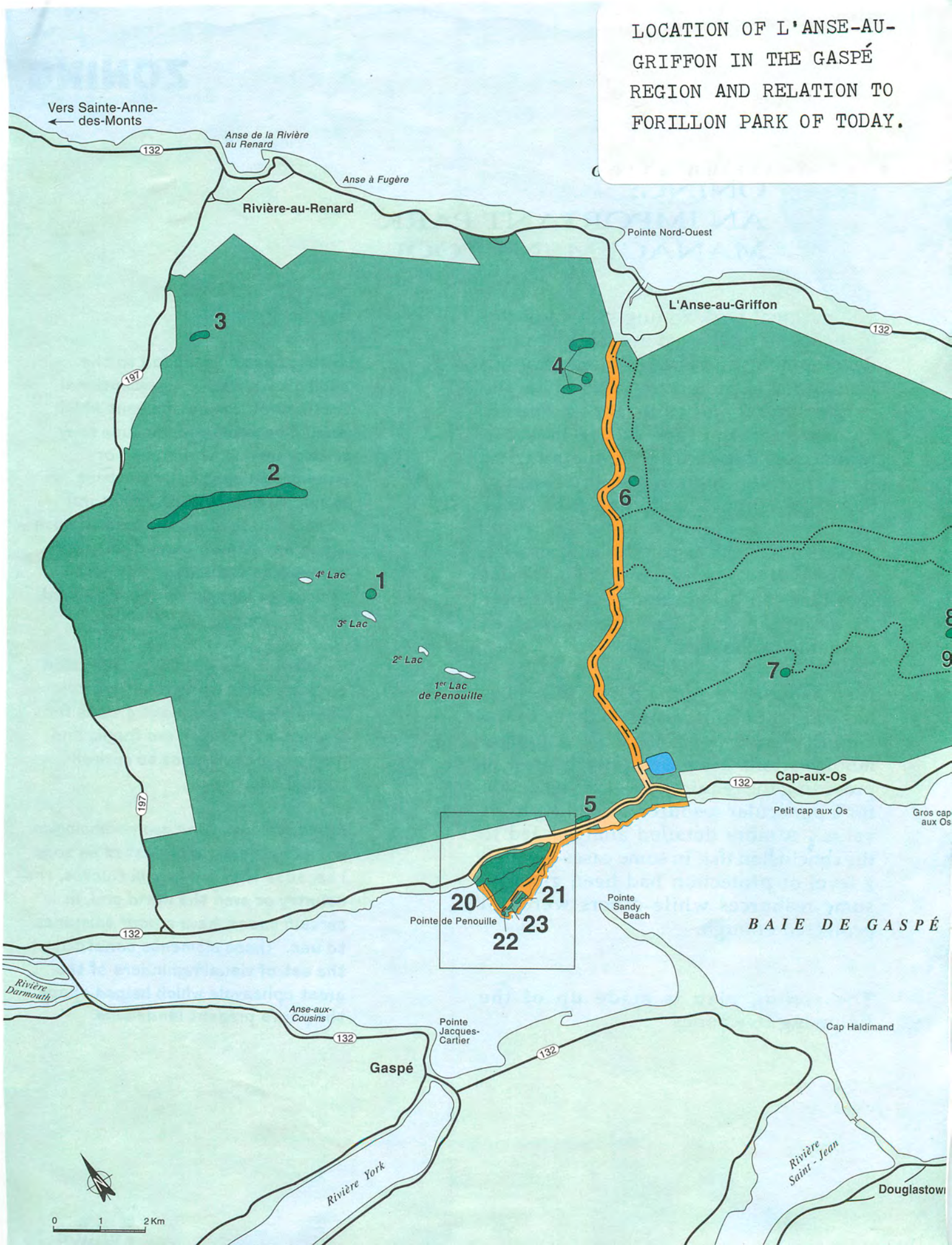
LOCATION OF L'ANSE-AU-GRIFFON IN THE GASPÉ REGION AND RELATION TO FORILLON PARK OF TODAY.